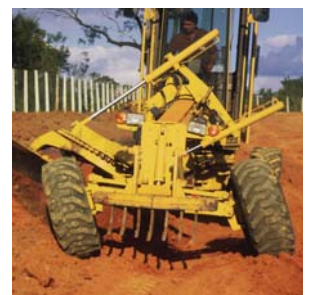
90° Bank slope saddle