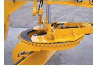
53" gear driven circle with "A" frame allows 360° blade rotation