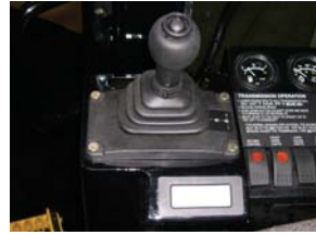
Full power shift transmission with torque converter